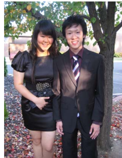
Commencement Dinner 09