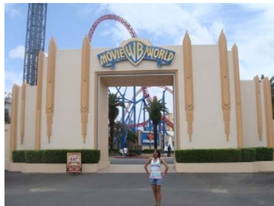
Movie World, Gold Coast