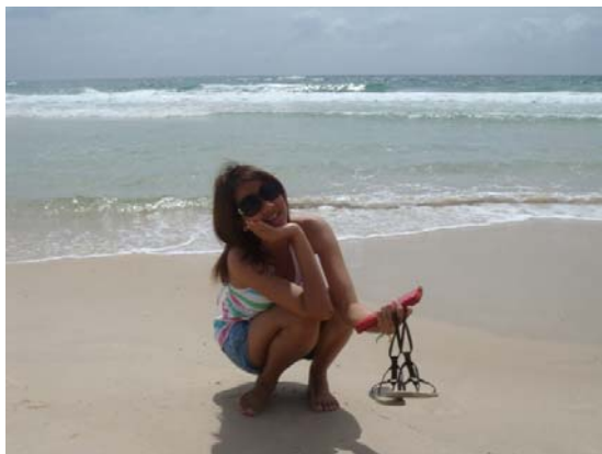
Surfer Paradise, Gold Coast

Gold Coast is also a fun place to visit because it has very nice coast all along the city, and when the sun shines, the color of the coast is gold and that is how it gets its name- Gold Coast. Not only nice shore and beach, but Gold Coast also has the biggest theme parks and water parks in Australia, including Movie World, Dream World, Water World, Sea World, etc. These make Gold Coast another wonderful place to visit.