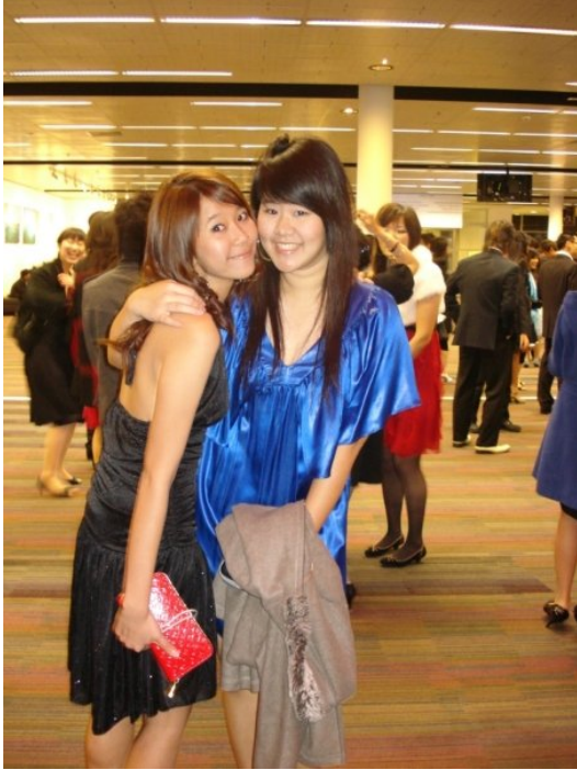
International Ball 08

On-campus accommodations are also further categorized into two major types, catered and self-catered hall.