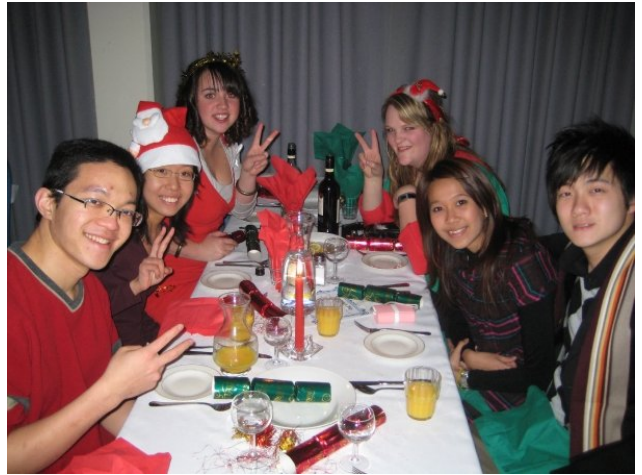
Christmas in July

Catered is where residents are provided with food for three meals every day. There are also fruits, salad, bread, side dishes that students can choose. Living as these places are very easy and convenient. Nevertheless, people can get bored of the food very easily and tastes are usually not as nice as self-cooked. Another drawback is the fixed time to eat. Each meal is fixed with an hour and a half time and this is quite troublesome if residents cannot make it during that time.