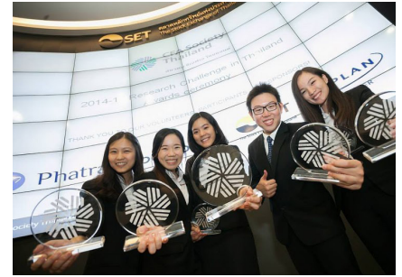
Student Achievements on the International Stage